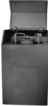
Catalog No. 010-010-200

Used for pulverizing, mixing, and homogenizing 10 to 500 gram sample sizes, this swing mill grinder reduces samples to 100 to 400 mesh (see mesh size on page 11). A maximum sample of 13 mm is placed in a grinding container with a puck and ring. Once the container is covered and installed in the grinder, vibration action reduces the sample. A manual self-adjusting clamp maintains sealing pressure to prevent sample loss during grinding. Applications include wet and dry production samples, mineral, soil, rock, cement and glass.