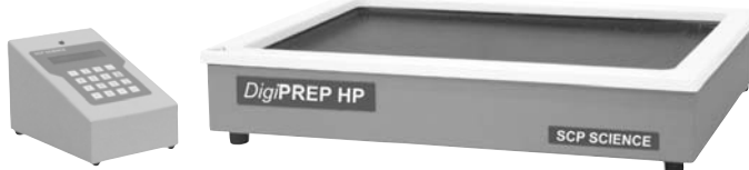
Catalog No. 010-500-220

DigiPREP HP has solved the problem of "hot spots" due to localized heat sources in traditional hot plates. This is achieved through a heating mat which covers the entire bottom of the Teflon® coated graphite plate. The graphite plate offers corrosion resistance and superior thermal conductivity compared to conventional hot plate surfaces and has a \pm 1^\circ\text{C} variation across its surface. Direct sample heating is monitored and controlled by a Teflon® coated thermocouple probe ( DigiPROBE , optional, see page 27) placed in a control sample or in the well located in the graphite plate. DigiPREP HP operates with the KeyPad, PC Classic or Touch Screen controller (sold separately, see page 23 and 24 for more details) and is CE, UL, and CSA approved.