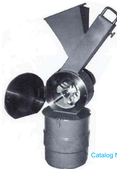
Catalog No. 010-010-300

When specifying screen size, note that the average particle size of the ground material that passes through a screen is always much smaller than the holes in that screen. For example, a typical medium-hard sample passed through a 35 mesh (.425 mm) screen, yields a particle distribution in which 95% of the material particle size is less than 115 mesh (.125 mm) and 40% is less than 270 mesh (.053 mm).